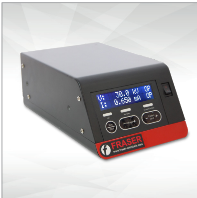
IONFIX Compact Static Generator