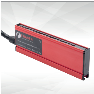
7160 Static Generator Bar