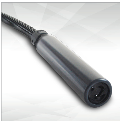
7090 Static Pinner