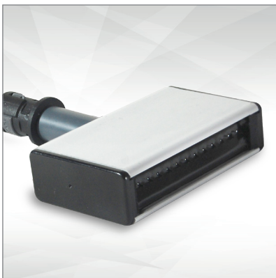
7095-12 Static Pinner