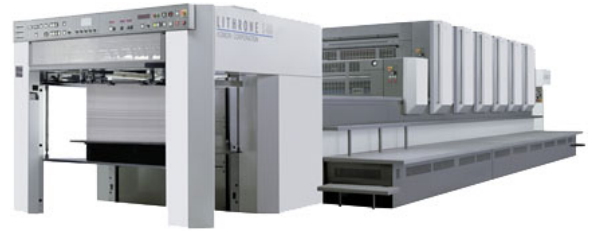
A Komori Sheetfed Offset Press

Traditional printing on paper is usually done on offset / litho machines. They can be sheet fed presses for short runs or web offset for longer runs for large magazines, newspapers etc. Most books, brochures, magazines are made by this process. It is "offset" because the image is put onto a plate then onto a rubber blanket and then transferred onto the paper.