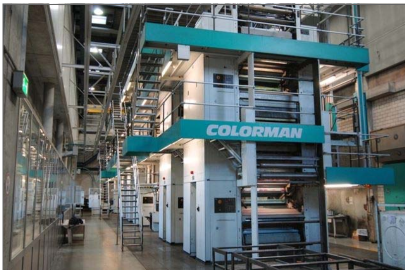
Web Offset Newspaper Press