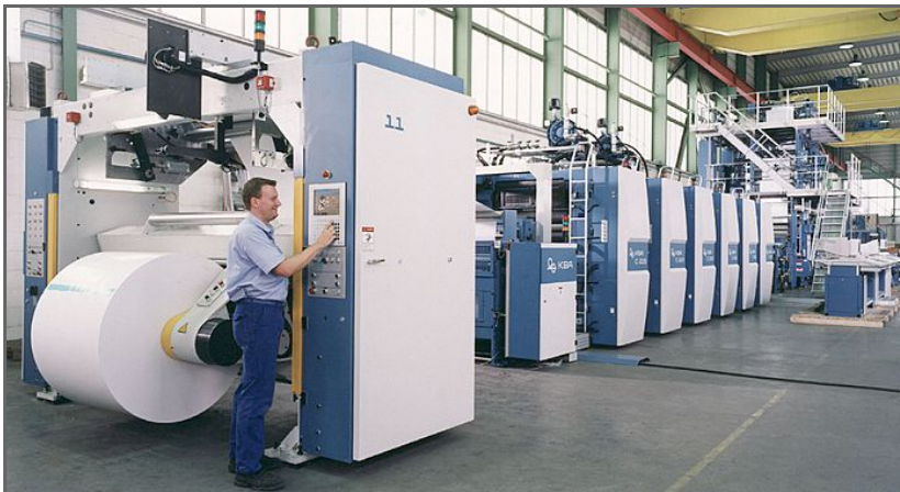
Commercial Web Offset