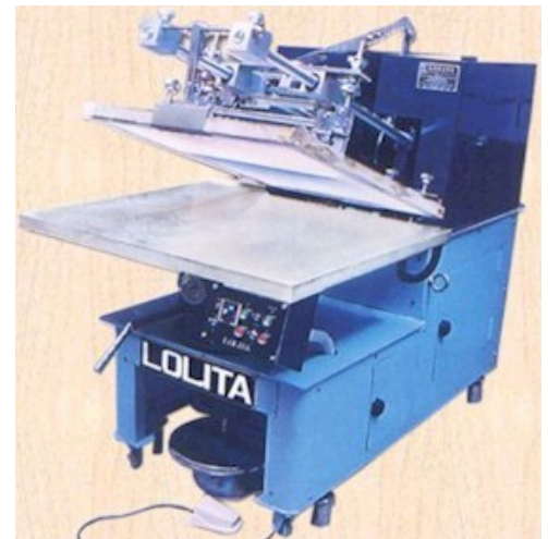
A small hand operated screen printer

See two application sketches "Screen Printing " for further details.