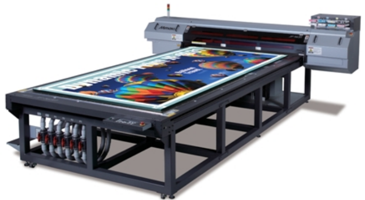
Flatbed UV Digital Printer

The main static problems are on flatbed machines printing with UV inks onto rigid plastic sheets. These have dust as well as printing problems.