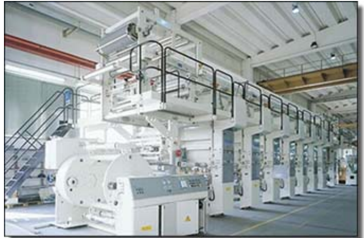
Cerutti Gravure Press

Use EX equipment. Big names are Cerutti (I) Omet (I) DCM (F) W&H (D), Fischer & Krecke (D).