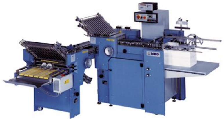
MBO Folding Machine