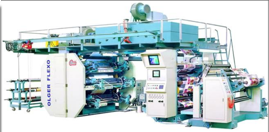
Common Impression (CI) Flexo Press, with 6 print units around a big central drum.

Most use water based inks, some use solvent based inks - so EX could be an issue.