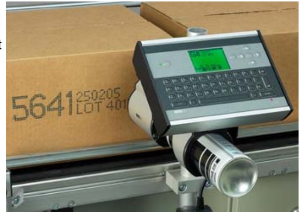
Simple Inkjet Coder

-see application sheet "Inkjet Coding and Marking"