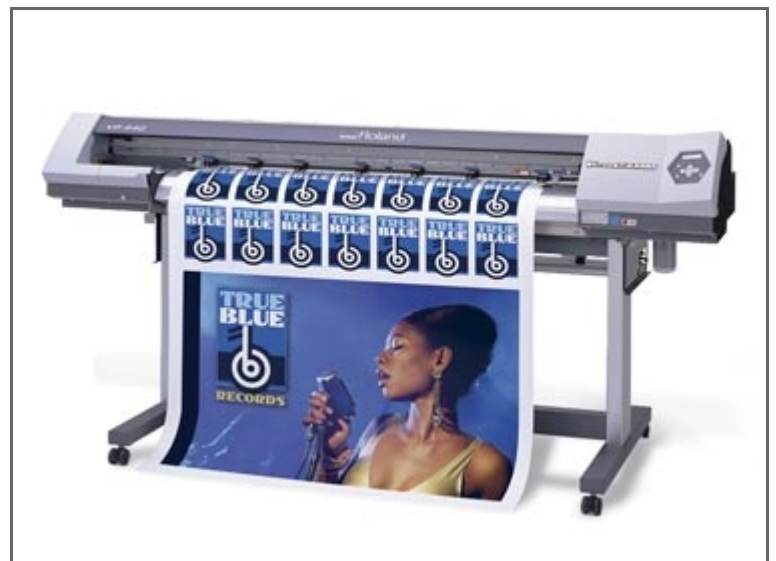
Solvent Based Printer for Flexible Materials

See application sketch "Graphical Digital Print"