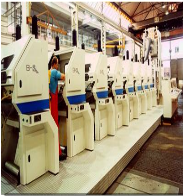
BHS Flexo VLF Press