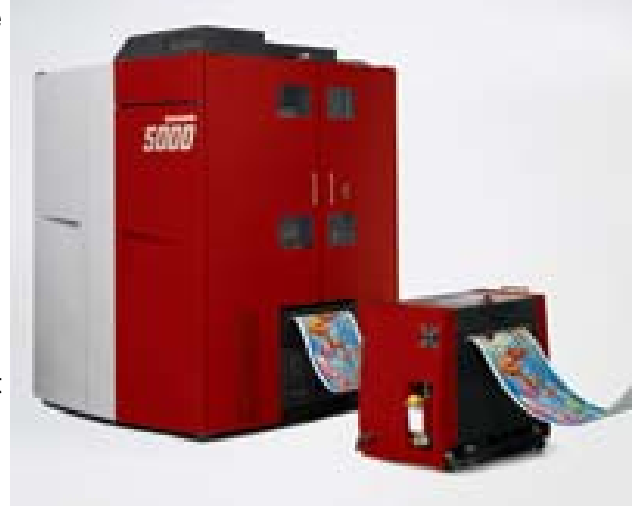
Digital "Document" Press

The static problem can be throughout the processes.