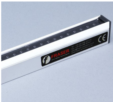
1250-S Static Eliminator Bar

The Bars are powered by a HP50-2 Power Unit.